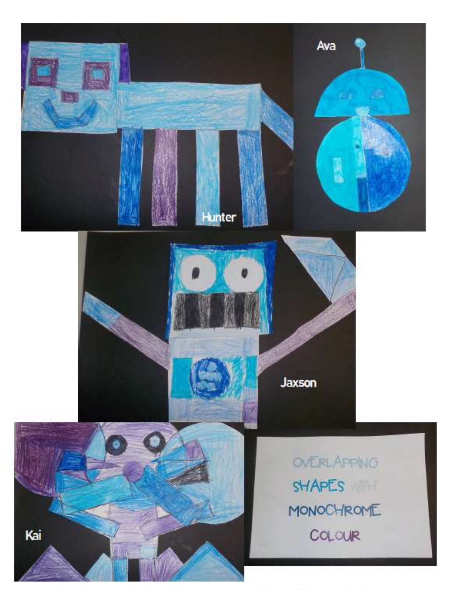
At Kersbrook Primary School we value Respect, Responsibility, Confidence and Resilience