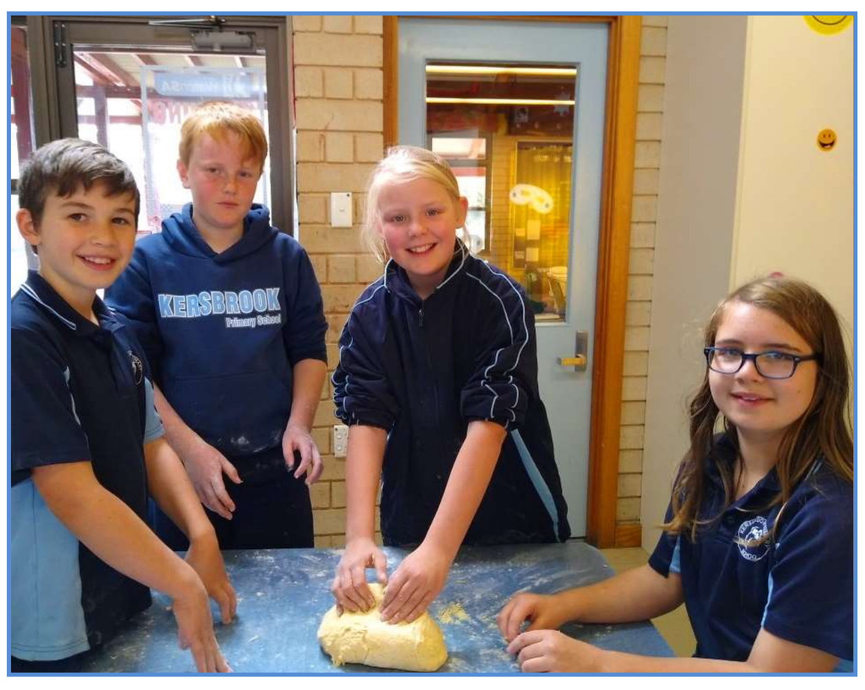
At Kersbrook Primary School we value Respect, Responsibility, Confidence and Resilience

During cooking we also learn about maths and science. The measurements and ratios of ingredients are important. Reading the recipes and following the procedure are also important for success. During the cooking process, heat creates chemical changes such as causing the scones to rise and giving them a nice crust.